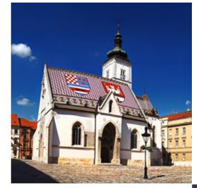
Looking forward to...