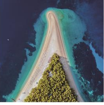
Croatian Presidency of the Council of the European Union