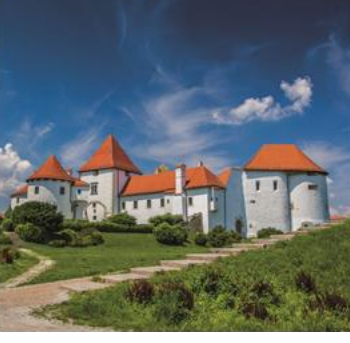
Hrvatsko predsjedanje Vijećem Europske unije