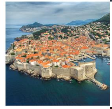
Présidence croate du Conseil de l'Union européenne