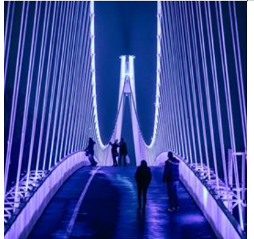
Kroatischer Vorsitz im Rat der Europäischen Union