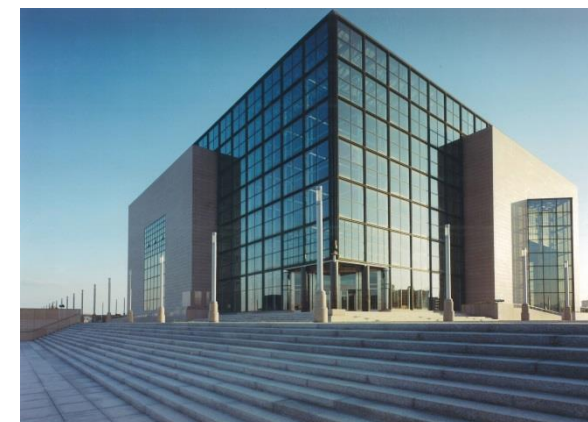
National and University Library in Zagreb