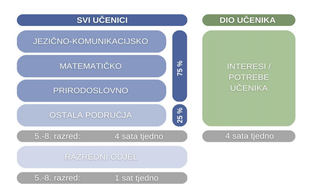
Figure 2. Structure of the Program of Supported, Assisted, and Enriched Learning (A2) in subject classes

use all mechanisms of horizontal flexibility. Depending on the dynamics of the teaching process in regular classes, the progress and needs of the students, teachers, and schools can, in a given week, devote a greater number of study hours, or even all of them, within the framework of the A2 Program to one educational area. In contrast, the study hours in another area will be covered during another week. The didactic and methodical organization of the time available for the A2 Program on a weekly basis by area does not have to reflect a fixed (daily and/or) weekly schedule of learning activities within a particular area (e.g., a determined distribution of one hour per area per week that is repeated every week), which is fixed throughout the academic year. One of the examples is the determination of the total annual number of hours of mandatory support (140 teaching hours), the determination of the time related to certain areas, and the implementation of support throughout the academic year through different weekly schedules related to certain areas. The structure of the A2 Program in subject teaching is shown in Figure 2.